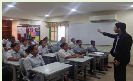
Below, Bahrain City Centre Client visited the QZS Training Centre.

A total of 165 operatives and staff for this prestigious site were fully trained.