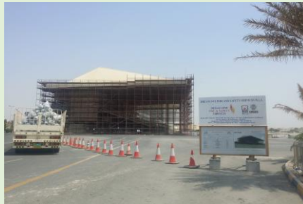
Well done to the DOFSS Team!!

DOFSS continues its growth by winning a new project with Abdullah H. AlDerazi Co W.L.L located at Sheikh Rashid Horse Racing Club -Sakhir to supply and apply Amerlock System. Total project value is BD95,000.00.